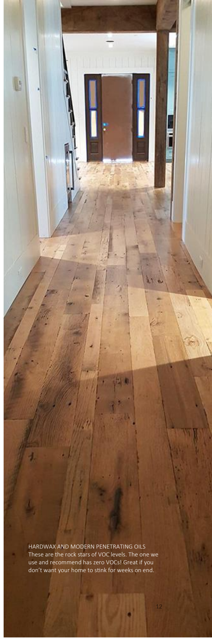
HARDWAX AND MODERN PENETRATING OILS These are the rock stars of VOC levels. The one we use and recommend has zero VOCs! Great if you don't want your home to stink for weeks on end.

With certain systems, the custom colors and mixes you can achieve is incredible. If you want something completely out of the ordinary and unique then you'll definitely want to consider a hardwax-penetrating oil.