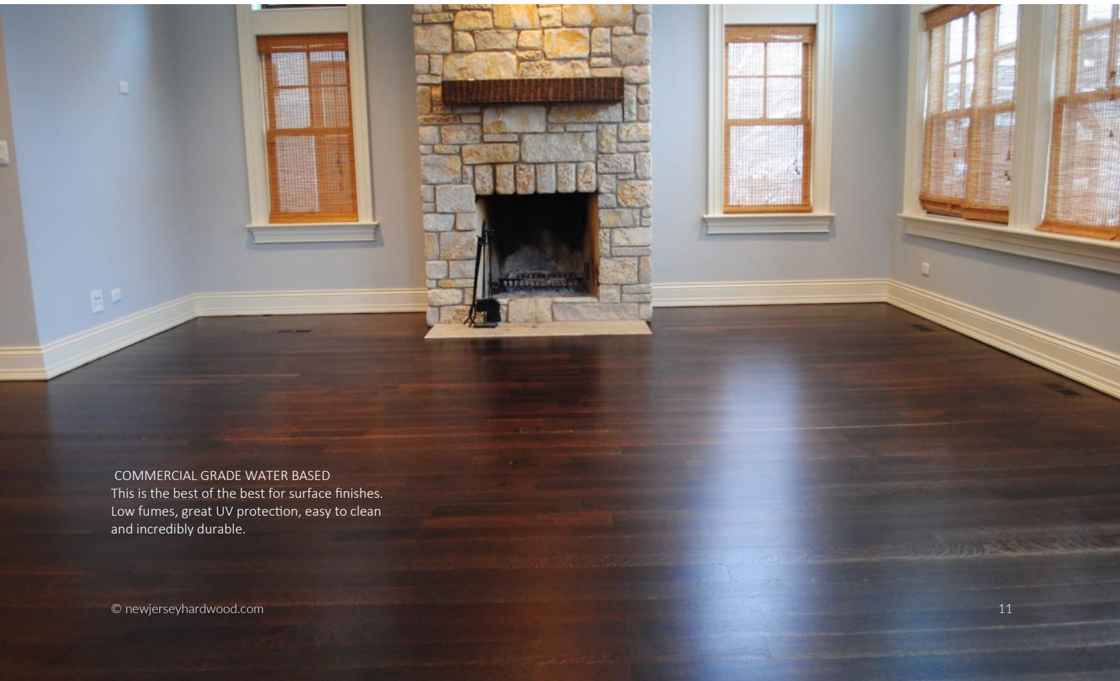
COMMERCIAL GRADE WATER BASED This is the best of the best for surface finishes. Low fumes, great UV protection, easy to clean and incredibly durable.

Both have less than 275 VOC. They come in Gloss, Semi-Gloss and Satin. Dry time is around 2 hours and the StreetShoe top coat is 90% cured in 24 hours! -----